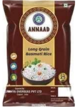
Annaad Long Grain Basmati Rice