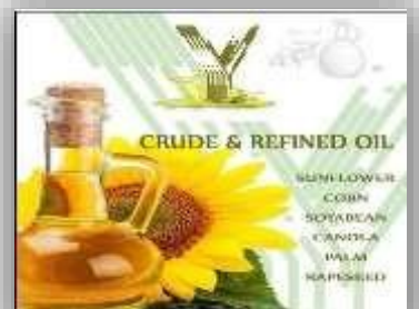
Sun Flower Oil